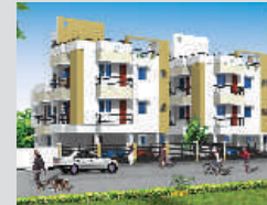
Sumukha @ Venkateshwara Nagar Extn., Ambattur