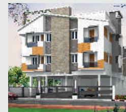
Harita @ Tambaram