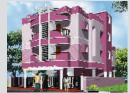
Vageesa @ Chidambaram