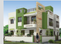
Sukeertha @ Ambattur