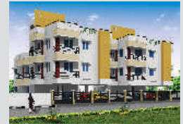
Shanmukha @ Maruthi Nagar, Ambattur