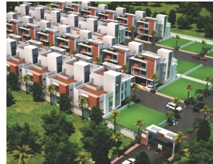
Bhavathara Plots Apartments Perumbakkam