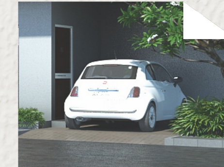
Car Parking Space