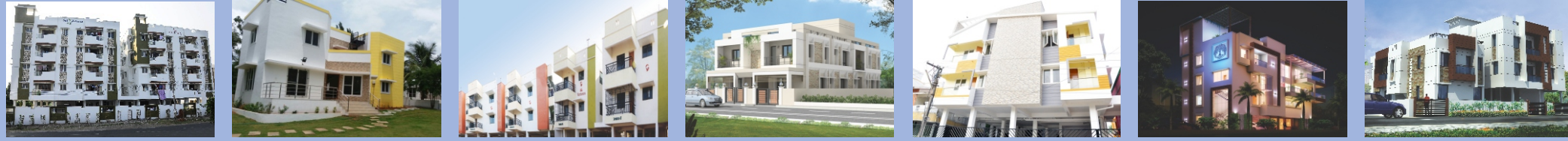
Sai Niketan 2016 Sithalapakkam