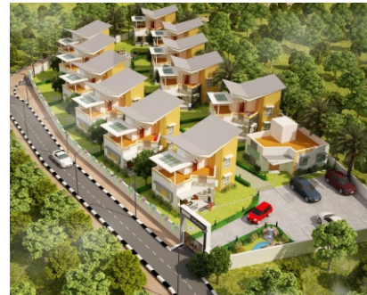
Sai Prithvi Phase II Week end Villas Yelagiri