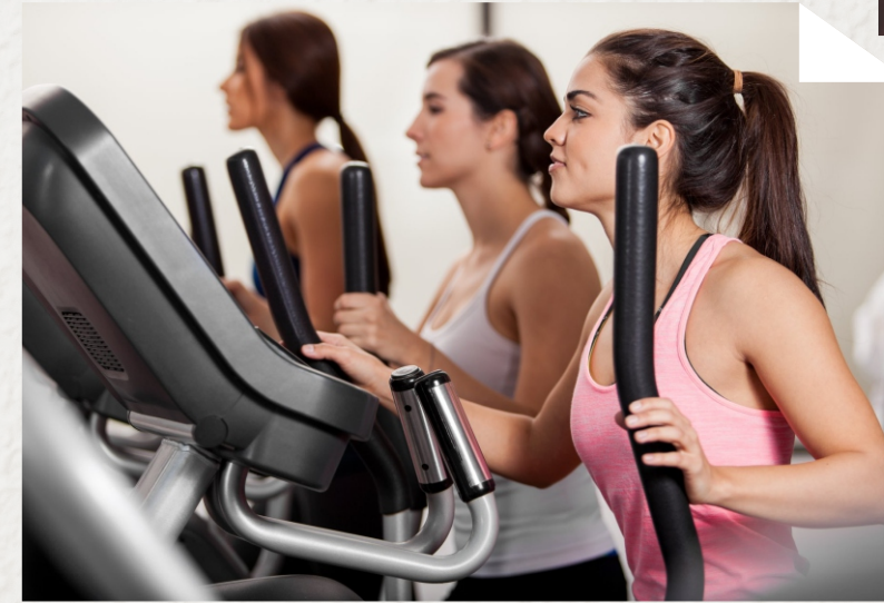
Well Equipped Gym